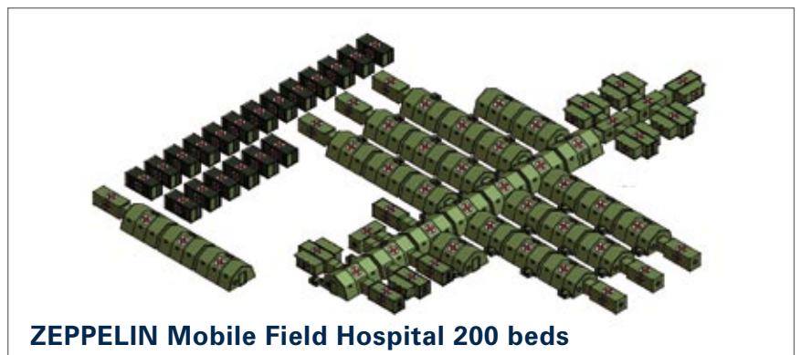
ZEPPELIN Mobile Field Hospital 200 beds