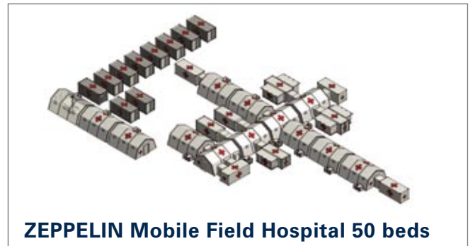
ZEPPELIN Mobile Field Hospital 50 beds