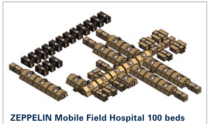
ZEPPELIN Mobile Field Hospital 100 beds